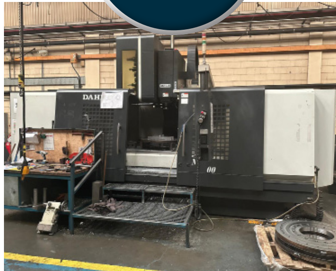
Lot 13: DAHLIH MCV2100 Vertical Machining Centre with Fanuc Series 0i-MD Control (2013)