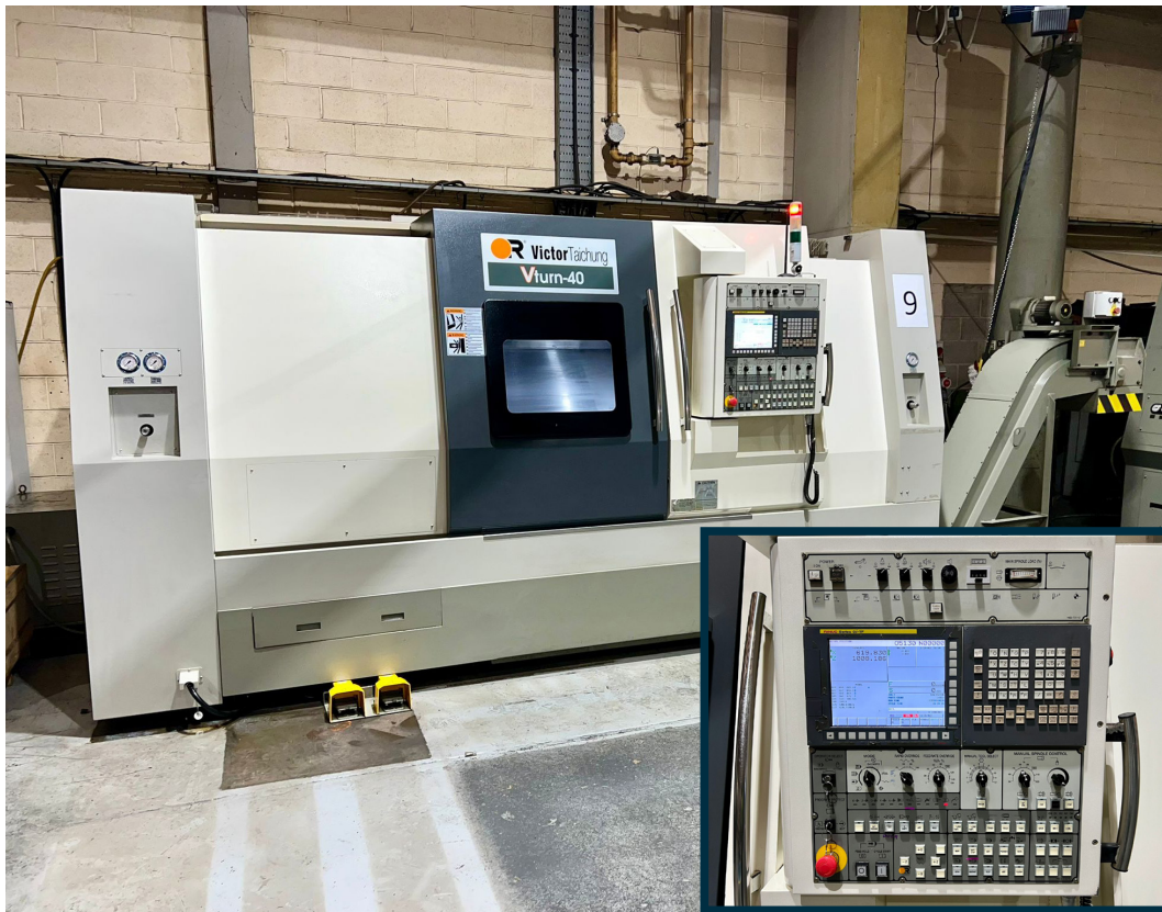
Lot 4 VICTOR VTURN V40/125 CNC Lathe with Fanuc Series 0i-TF Control (2018)

MODERN CNC LATHES & MACHINING CENTRES WEST YORKSHIRE, ENGLAND