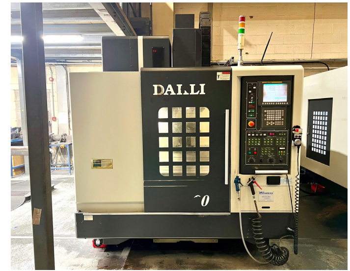
Lot 8: DAHLIH MCV720 Vertical Machining Centre with Fanuc 0i-MD Control (2012)