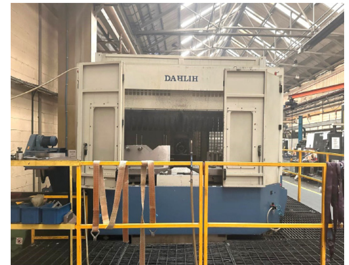
Lot 15: DAHLIH MCH800 Twin Pallet Horizontal Machining Centre with Fanuc Series 0i-MD Control (2012)

Phase 1 - Lots can be purchased and released immediately. Phase 2 - Lots can be purchased immediately but only released in February, 2025.