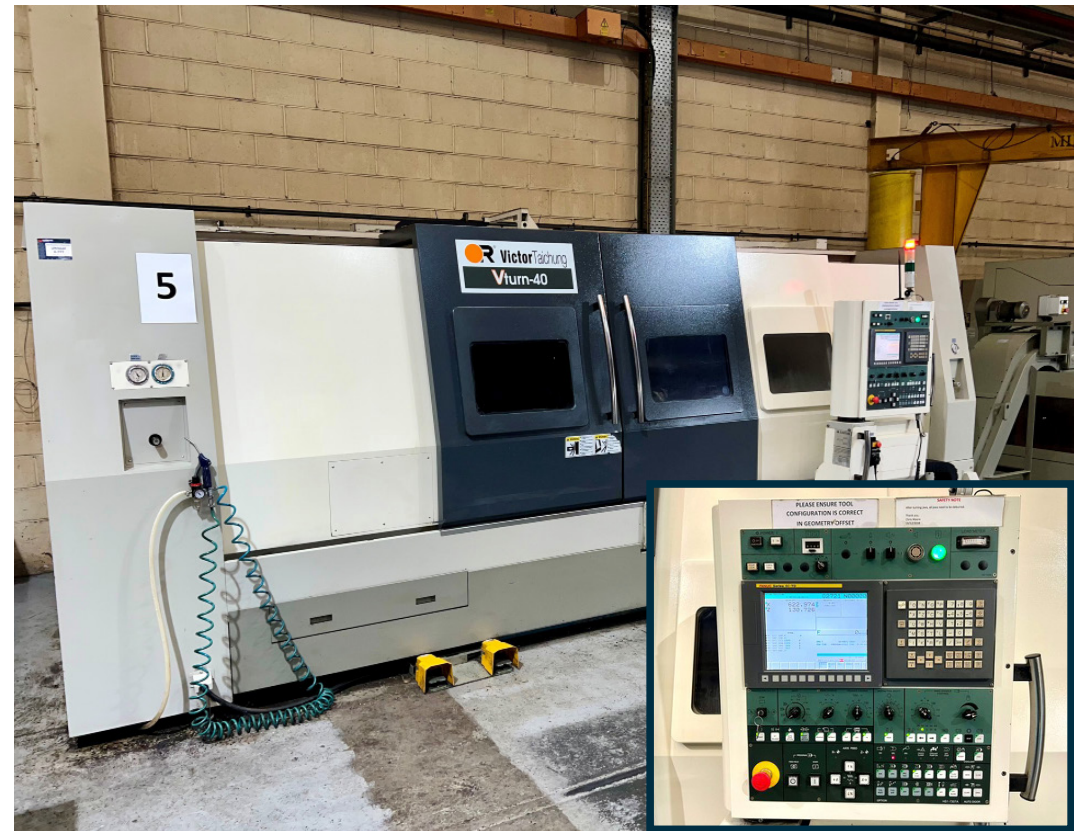
Lot 3 VICTOR VTURN V40/220 CNC Lathe with Fanuc Series 0i-TF Control (2013)

On instructions received due to the retirement of the Directors