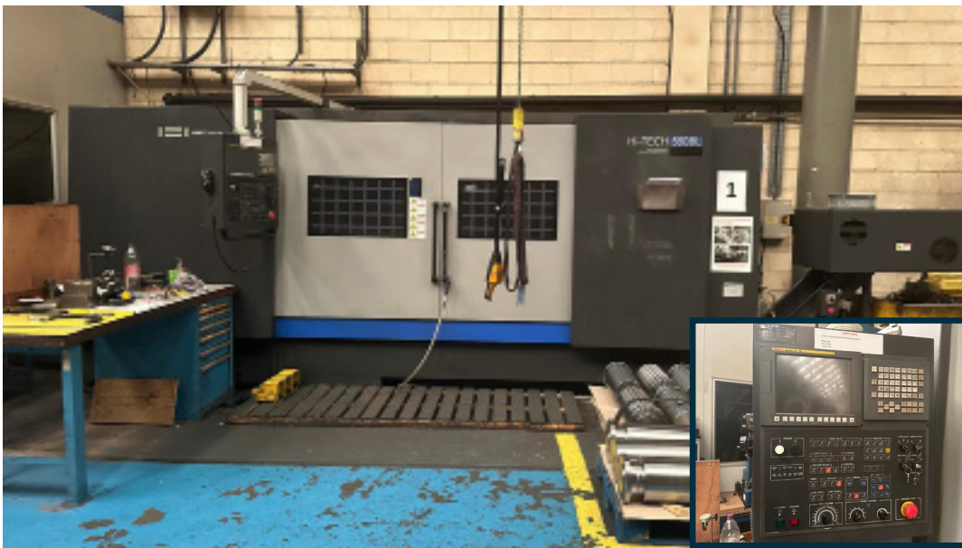
Lot 9: HWACHEON Hi-Tec 550BL CNC Lathe with Fanuc Series 0i-TD Control (2011)