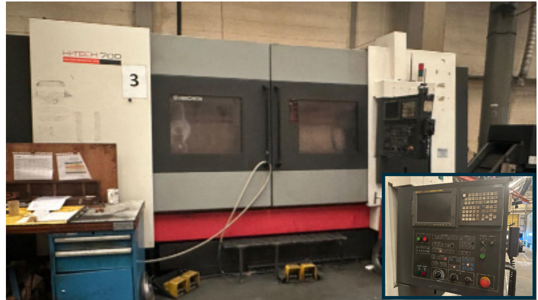
Lot 10: HWACHEON Hi-Tec 700 CNC Lathe with Fanuc Series 18i-TB Control (2008)