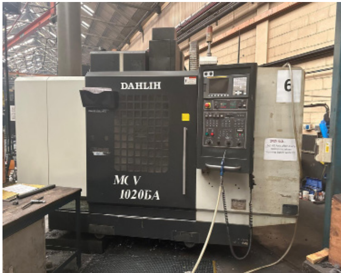
Lot 5: DAHLIH MCV1020BA Vertical Machining Centre with Fanuc Series 0i-MC Control (2007)