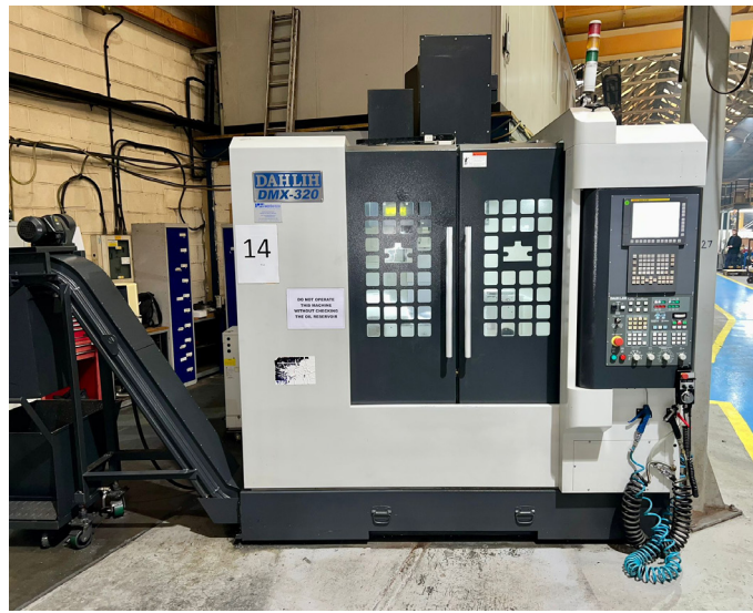
Lot 7: DAHLIH DMX320 5 Axis Vertical Machining Centre with Fanuc Series 0i-MF Control (2018)