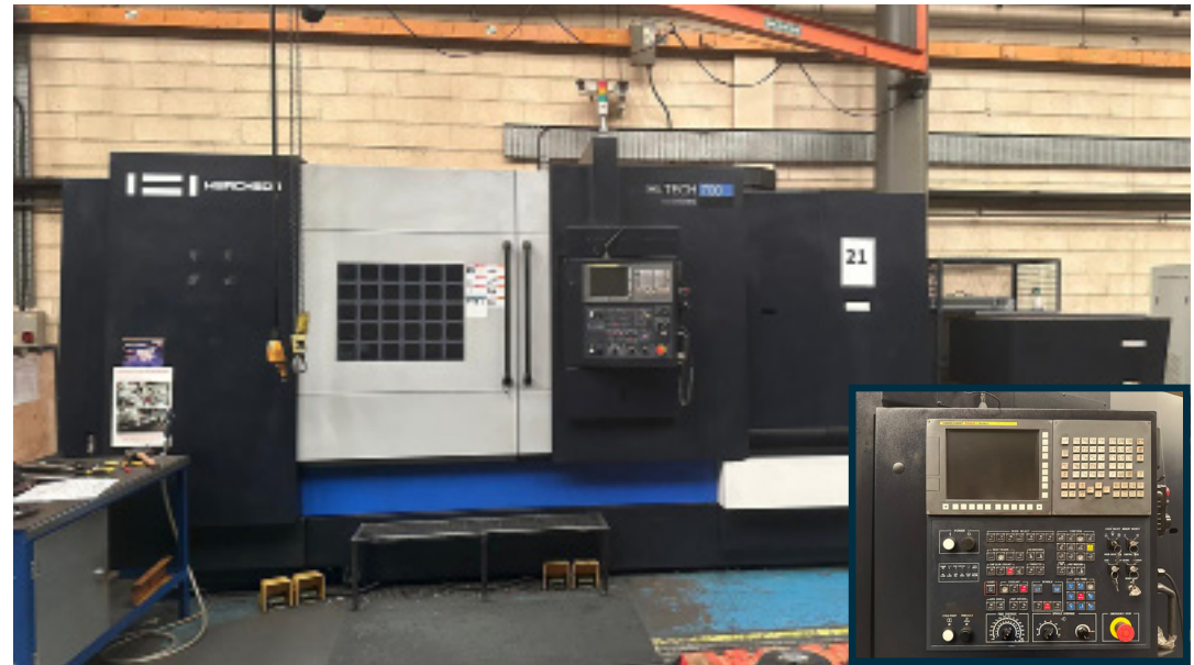
Lot 12: HWACHEON Hi-Tec 700 CNC Lathe with Fanuc Series 0i-TD Control (2019)

Viewing on site will be available by appointment only with the auctioneers Visiting parties will need to wear Personal Protective Equipment (PPE) No minors will be allowed on site. For further enquiries and prices, contact our Manchester office 0161 345 3000