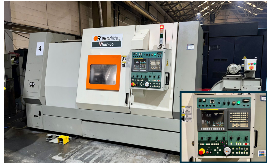
Lot 2: VICTOR VTURN 36/85 CNC Lathe with Fanuc Series 0i-TC Control (2008)

For more specification and photos log onto www.machinebidder.com Offers are invited.