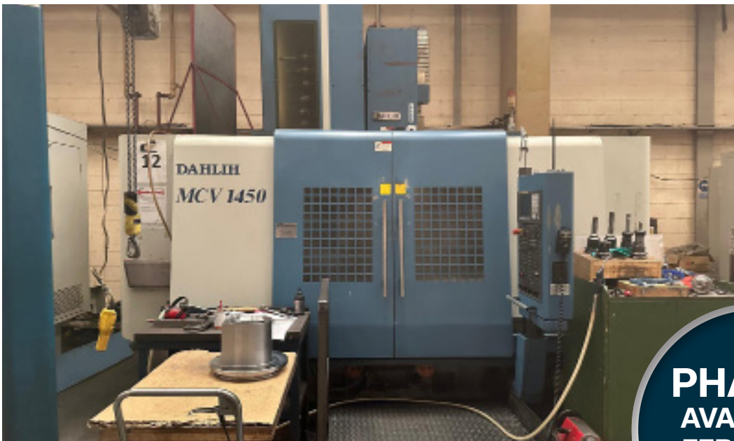
Lot 14: DAHLIH DL-MCV1450 Vertical Machining Centre (2019) (2 available)