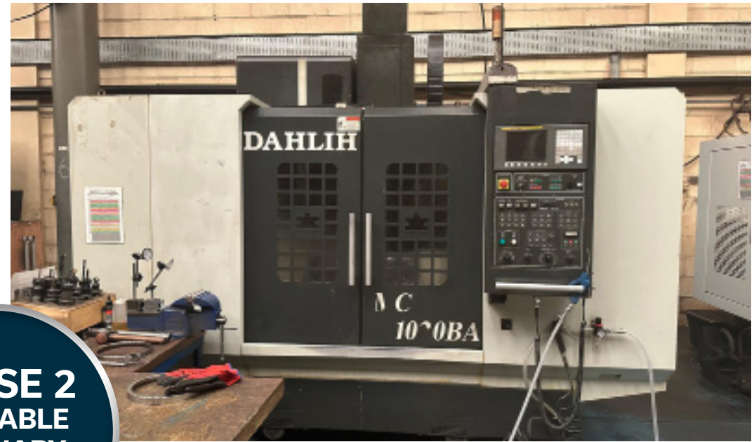
Lot 16: DAHLIH DL-MCV1020BA Vertical Machining Centre with Fanuc Series 0i-MC Control (2008)