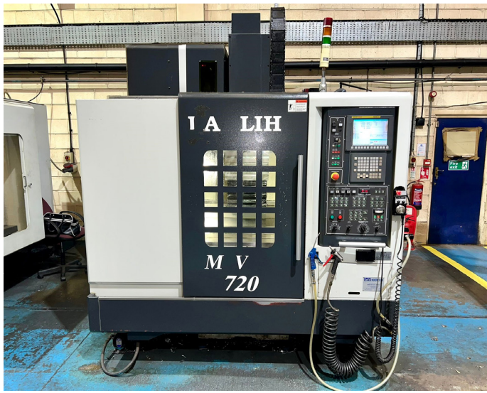
Lot 6: DAHLIH MCV720 Vertical Machining Centre with Fanuc Solution C Control (2013)