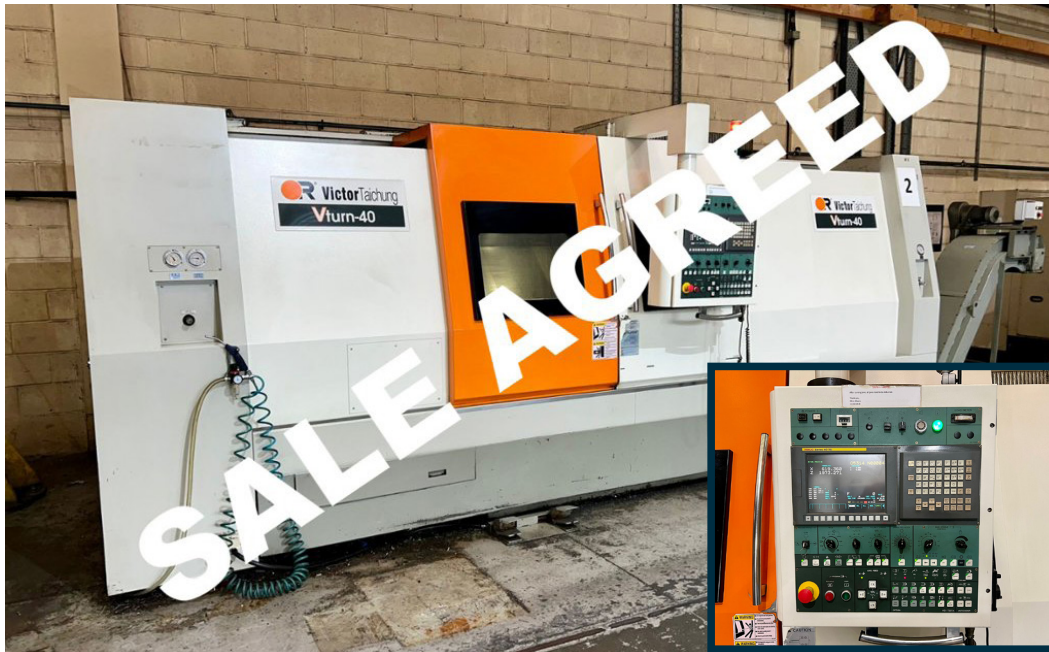
Lot 1: VICTOR VTURN 40/220 CNC Lathe with Fanuc Series 0i-TC Control (2008)